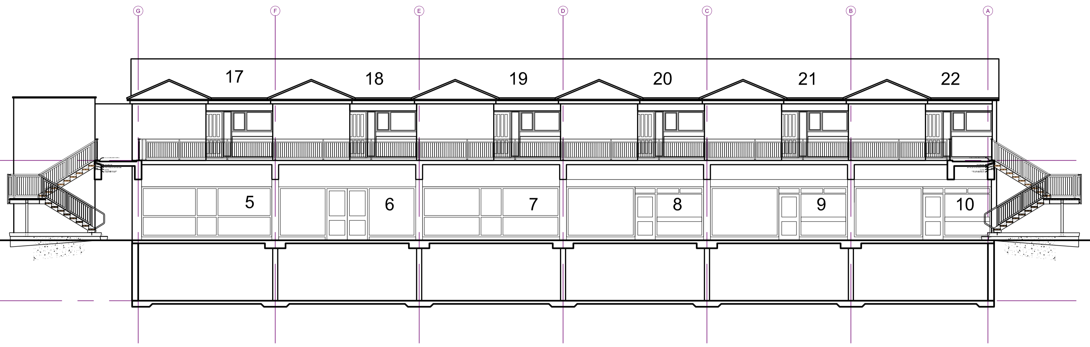
East Section Elevation NN - through Precinct